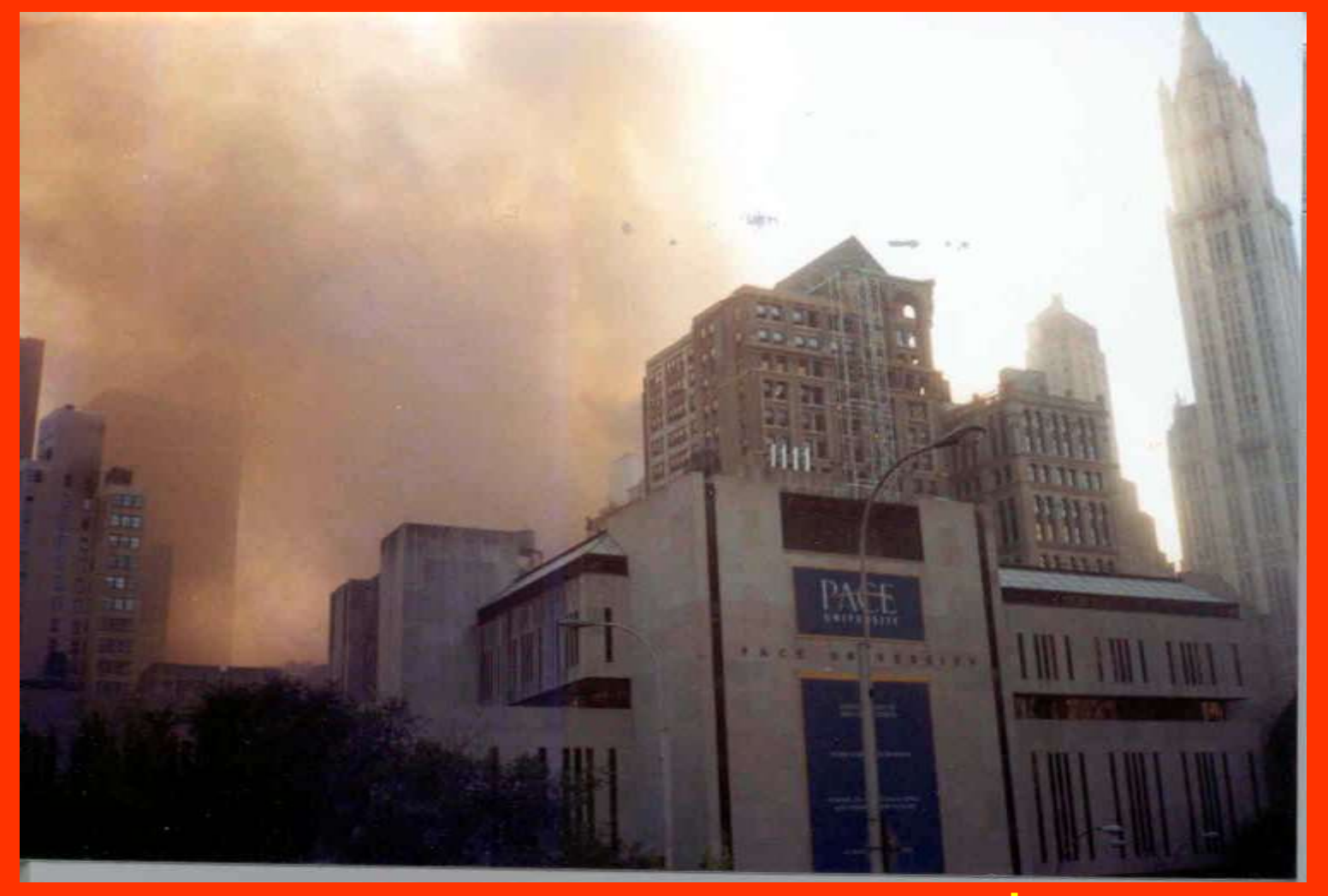
View from the Frankfort Street Side of Pace's downtown campus (World Trade Center smoke in background, about 6:00 PM, September 11, 2001)